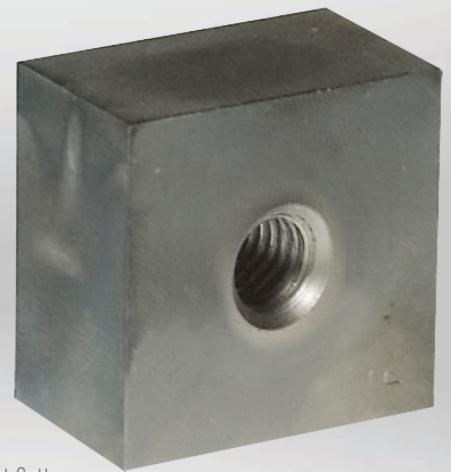
Flat Cutter Model #3530000080-F