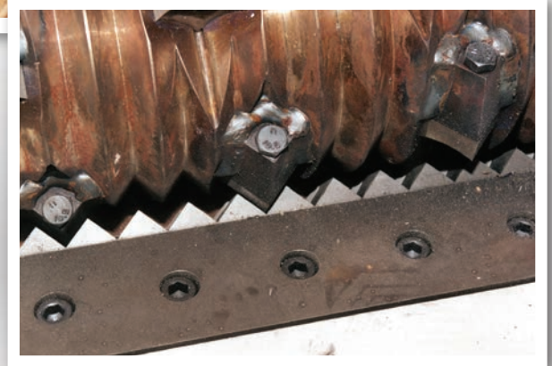
Counterknife standard tolerances are .015 to .020 clearances. Options are available for clearances to .010.

The Vecoplan design incorporates a heavy-duty, multiple piece cutting rotor assembly. It is engineered for high torque cutting efficiency and quiet operation.