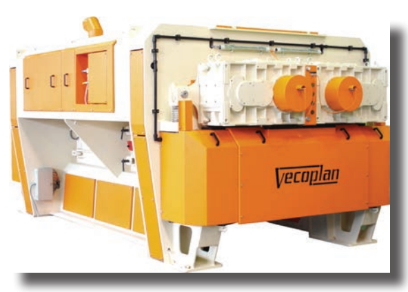
Vecoplan VNZ "W" Model