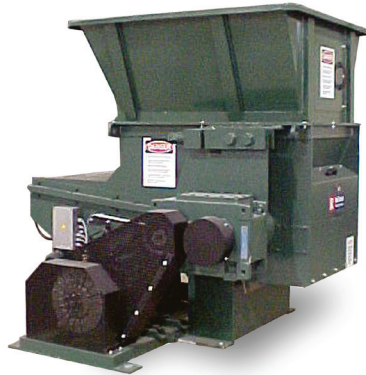
VAZ 800 XL MW