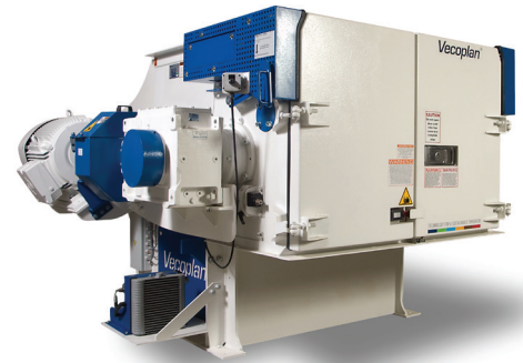
VAZ 1600 S XL MW