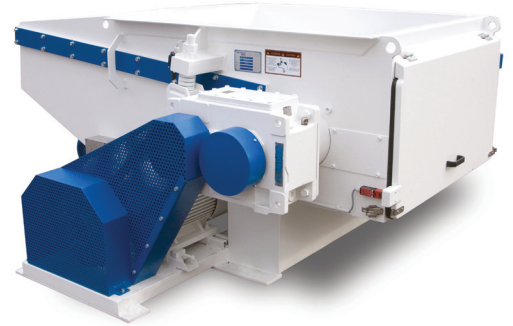
VAZ 1100 XL MW