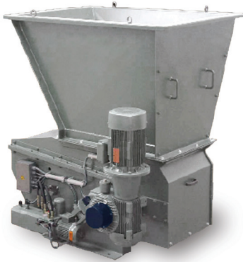
VAZ 600 XL MW