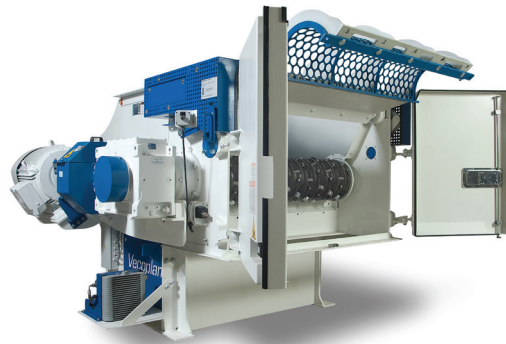
VAZ 1300 M MW