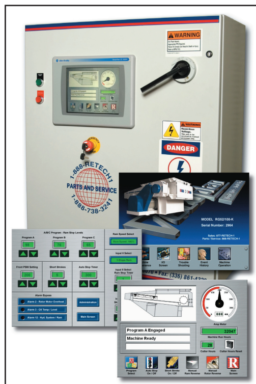
Rev 9-A HMI Control Panel